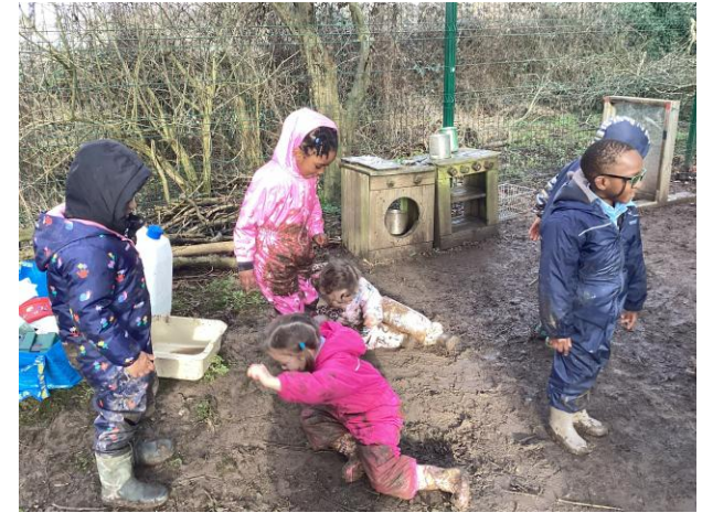
Fun in the mud