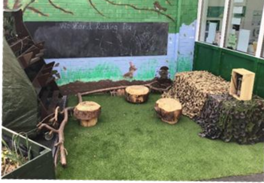
Role play area