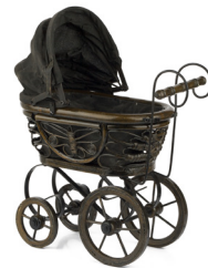
wood and metal pram