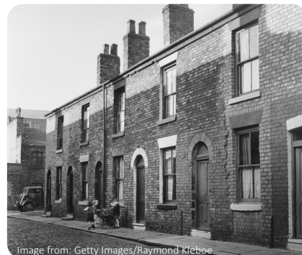
A street in the 1950s.

The way people use land changes over time. For example, in the 1950s there were fewer cars, so fewer roads were needed. Today lots of people have cars, so there are many more roads for people to drive on and driveways for parking.