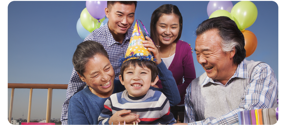
Birthdays happen every year.

Important life events include birthdays, religious festivals or family celebrations. Some life events happen every year and some happen at certain stages of human life.