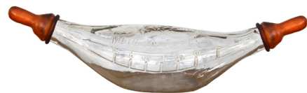
Victorian baby bottle

An artefact is an object from the past. Museums often display historical artefacts. Artefacts can tell us about how people used to live. Everyday objects like baby bottles, clothing, toys and books can tell us about childhood in the past.