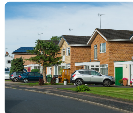
A street today.