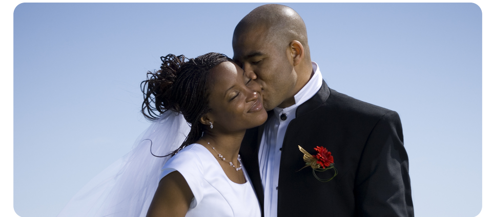
Weddings happen when two adults get married.