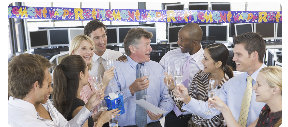
Retirement happens when an elderly person leaves work.