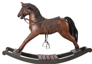
wooden rocking horse